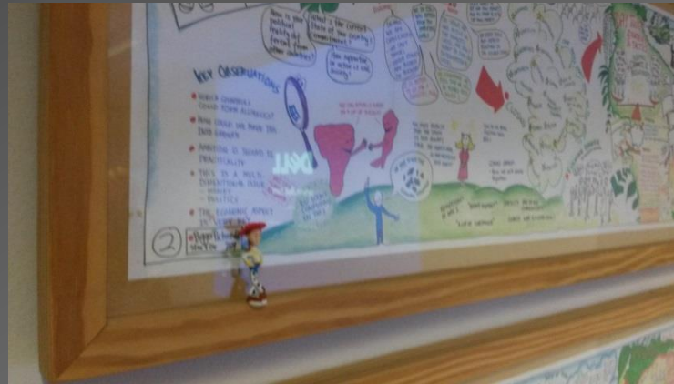
Nola feels quite @home here, they even do mind mapping as in the Film as Text course, what fun!