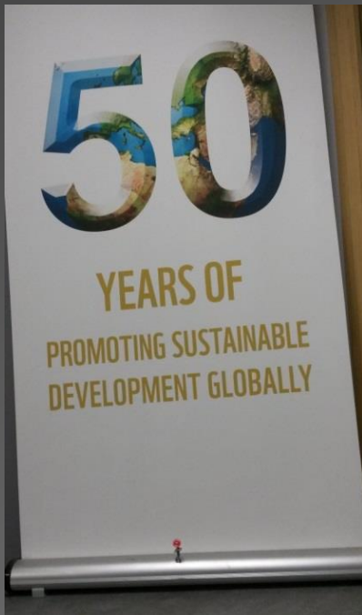
First excursion visit: the WWF Brussels office

The students seemed less curious about Nola, she could just hang out anywhere she wanted and nobody cared or asked questions. Just some friendly smiles as we moved from one meeting to the next.