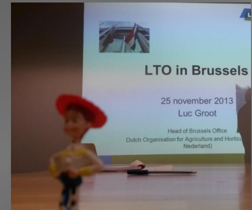
The agricultural lobbyist comes to meet the students...and 'the enemy' at his fortress. But the days of open battles between farmers and nature are far gone. Mutual interests colour the connections and a new one started here today as our speakers meet for the first time!